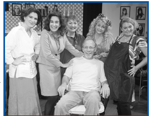
Steel Magnolias Facebook Fan event

Players, we have a tremendous amount of momentum that we intend to transfer over from our 59 th season, and what is already the fourth year of involvement on social media.